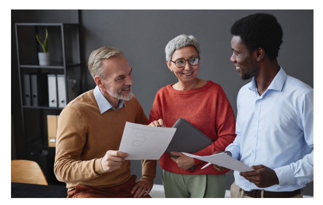
Glenbeigh is Here when You Need Us